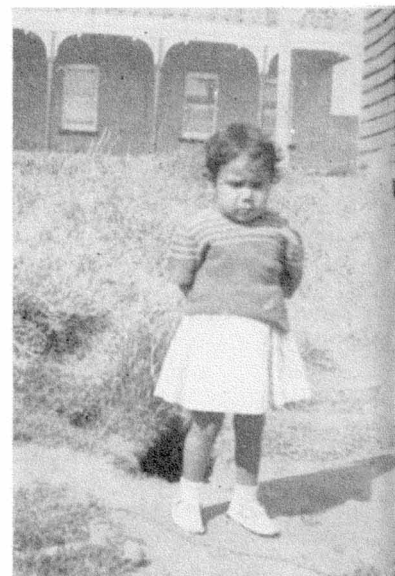
This sturdy little lass just wouldn't tell us her name. Guess who she is!