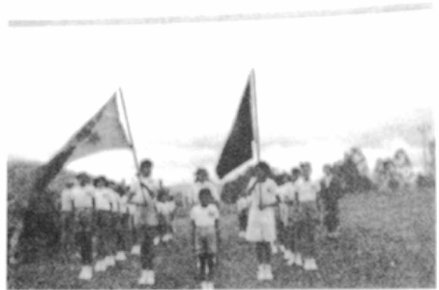
Nanima schoolchildren at the recent sports