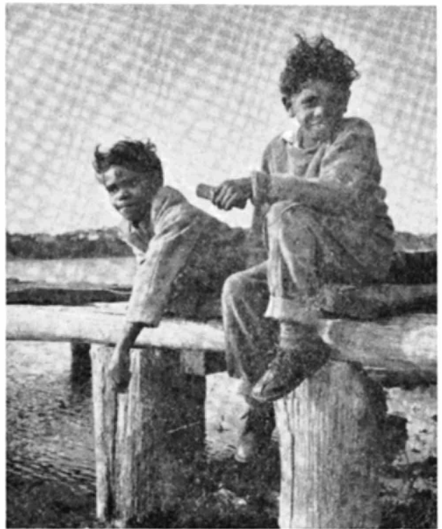
What can be more exciting to take a line and some bait—(any old bait will do!) and sit out on the end of the wharf where the big fish lurk. These lads certainly appear to be enjoying themselves.