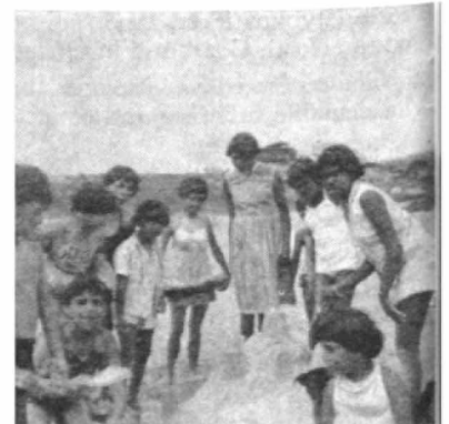
Three snaps of happy Cootamundra girls on the beach at Kiama