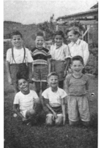
"Wilduns" of Nanima Second Class