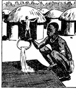
Man has tried to beat the heat for centuries. Some primitive tribes, for instance, faced their crude huts into prevailing winds and hung reed mats across the entrances which they sprinkled with water, creating a form of air conditioning.