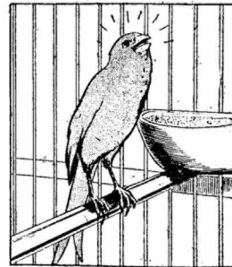
Authorities say the feathers of a yellow canary will turn red if the bird is fed paprika.