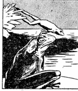
The world's largest frogs are believed to be those found in the Montaro River area in Peru. They measure as much as 24 inches in length.