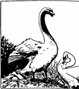
A swan can break a man's arm with its wing.