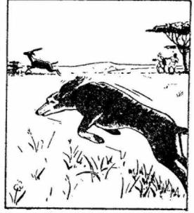
The Saluki, a slim dog of Asia, is thought to be the living representative of the first dog trained for hunting by man. Easily running at speeds up to 40 miles an hour, it can tire a gazelle.