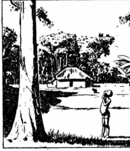
The fastest growing tree in the world is the Eucalyptus Saligna which in Uganda, Central Africa, has been known to grow 45 feet in 2 years. Bamboo, which is not botanically classified as a tree, has been observed to grow as much as 16 inches in a day, to a maximum height of 120 feet.