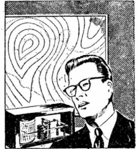
Scientists believe the four seasons of the year are slowly getting warmer.