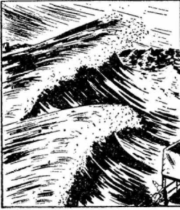
Sixty feet is usually cited by experts as the greatest possible height a wave at sea can attain. However, in the Pacific Ocean, on February 7, 1933, during a 68-knot gale, the U.S.S. Ramapo recorded a wave 112 feet from trough to crest.