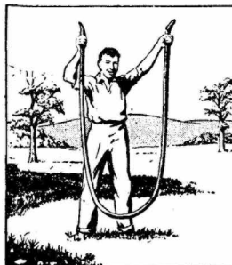
Australian earthworms sometimes reach a length of eleven feet and a weight of one and a half pounds.