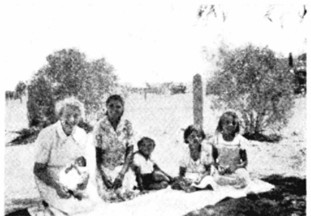
An Aboriginal family at Marree.