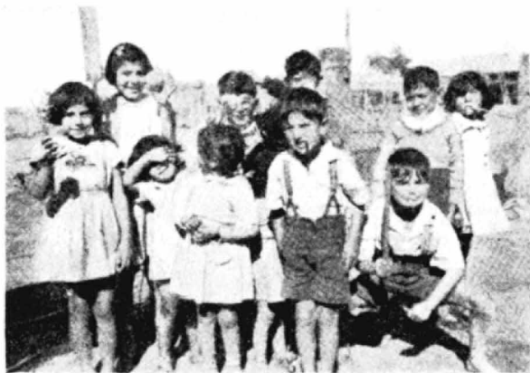
First of all a group of happy healthy school children, at Marree.

As the Cameraman made his way inland these are some of the people he met.