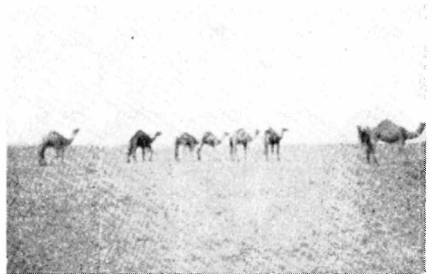
One of the many teams of camels one sees about Marree.