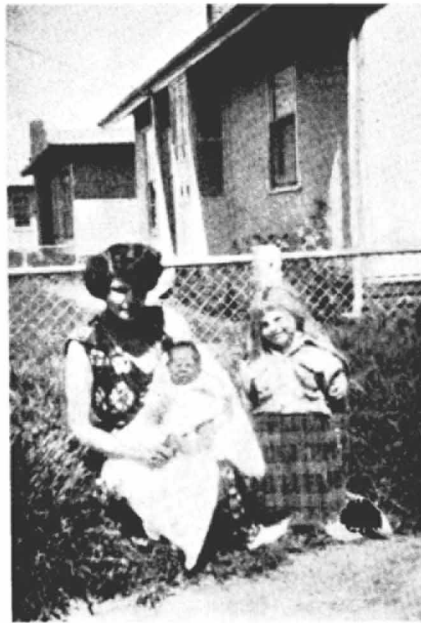
A happy little Swan Hill Group.