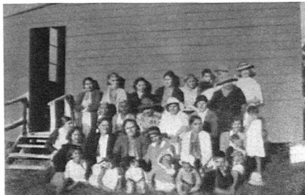
The Purfleet Sewing Group are a happy crowd as they pose for the camera.