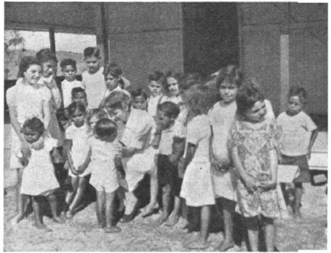
A "new" boy meets the teacher on his first day at Tabulam school.