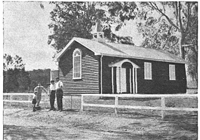
Station Church erected by the Board.