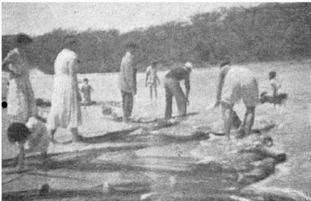
Everyone, even the dog, lends a hand (or a paw) when the haul is made.