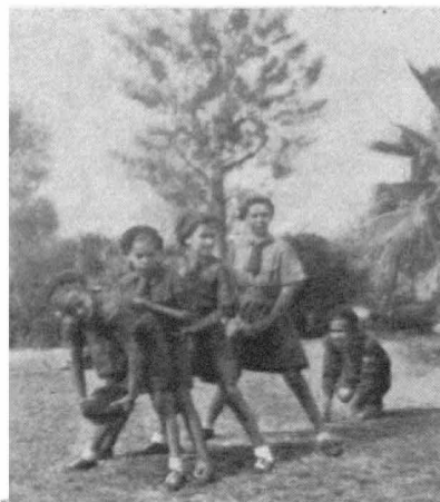
These Moree Brownies are expert tunnel ball players and put a lot of enthusiasm into the game.