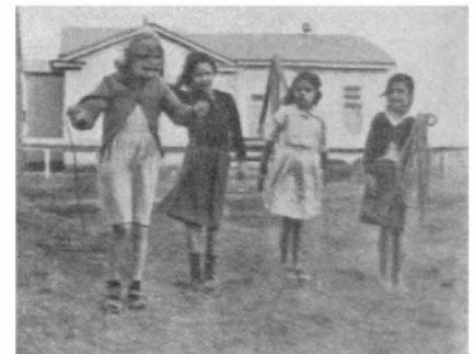
These little lasses find skipping the easiest way of keeping warm these cold mornings.